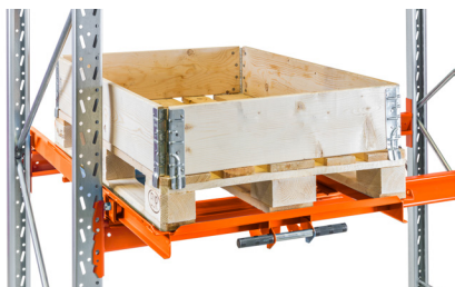
Slide-out unit for pallet, fitted on beams