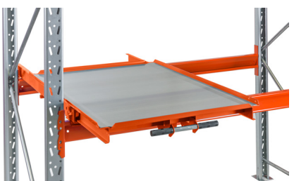
Slide-out unit with bottom plate for picking goods without pallet