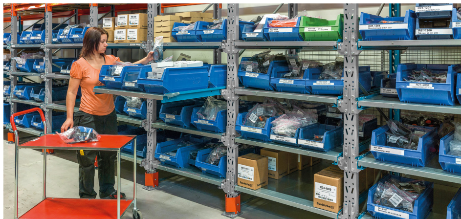
Slide-out shelf for picking goods without pallet, fitted on frames