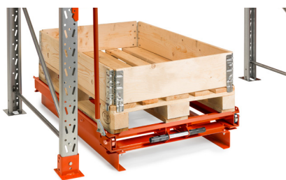
Slide-out unit for pallet with extension set for stacker truck