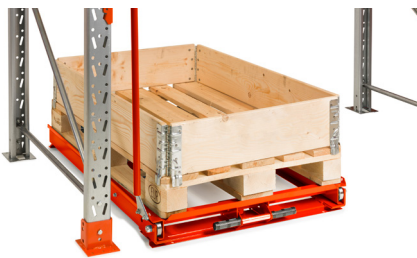
Slide-out unit for pallet, fitted on floor